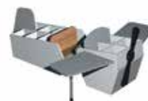
Traffic white [1]

Please add the selected colour code to the last digit of the Order No.