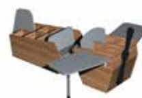
Olive wood decor [4]