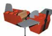
Flame red [2]

Please add the selected colour code to the last digit of the Order No.